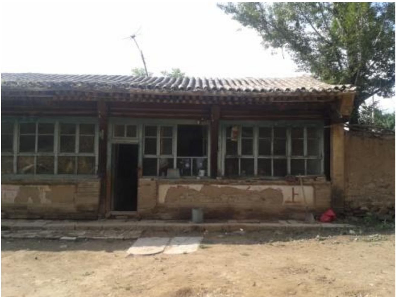
(Classroom could fall anytime)