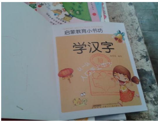
(Books that CHAFF donated)